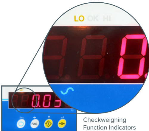
Checkweighing Function Indicators

Complete protection whatever the application. With grade 304 stainless steel, this IP68 bench scale looks the part.